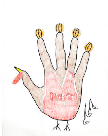
A hand turkey by Yao Ming

By MAGGIE GALEHOUSE Copyright 2008 Houston Chronicle Nov. 26, 2008, 3:30PM